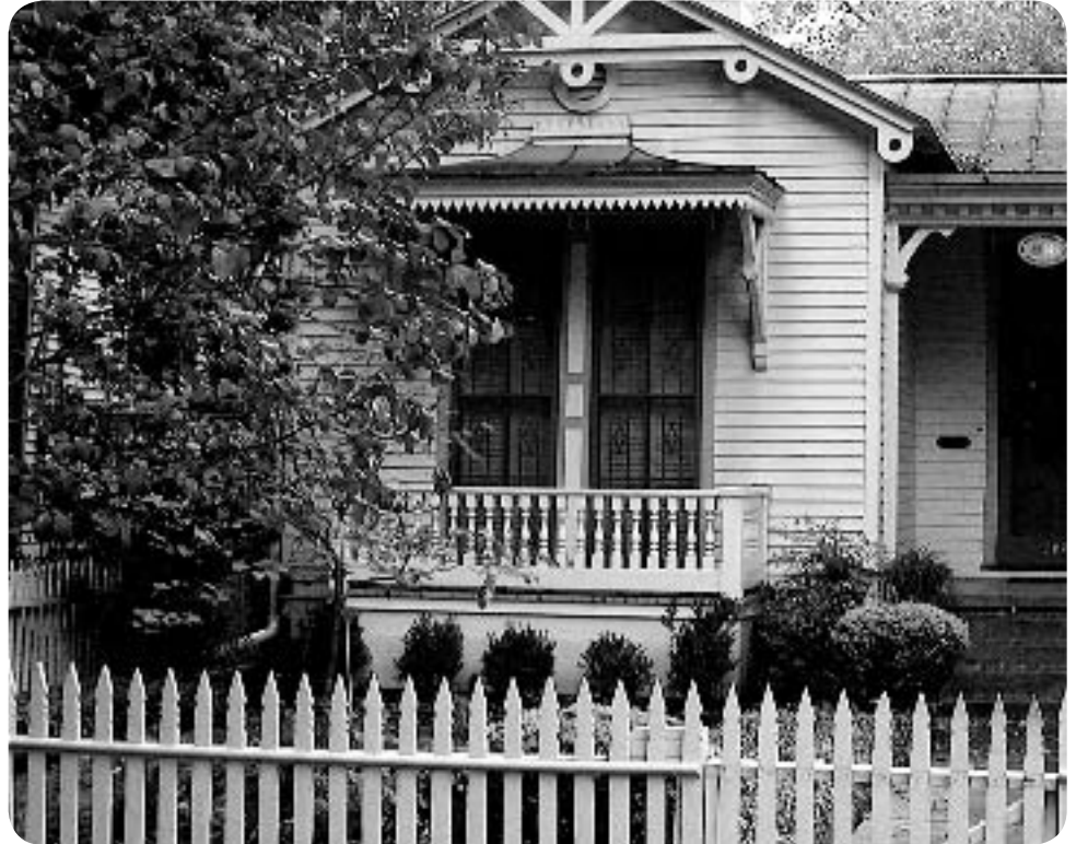
Margaret Leeds House - 308 King William - built 1883