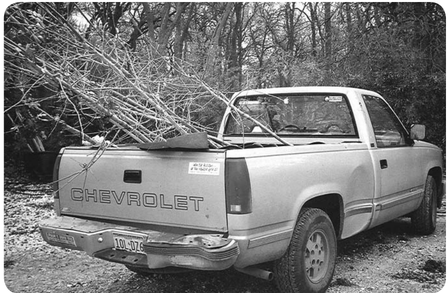
Unsung Hero - Darryl Ohlenbusch's pickup truck

Garden Note: The following is a Chinese Proverb passed along by a friend. "One generation plants the trees, and another gets the shade."