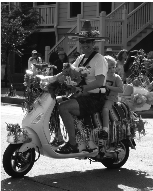
Scooter on Parade