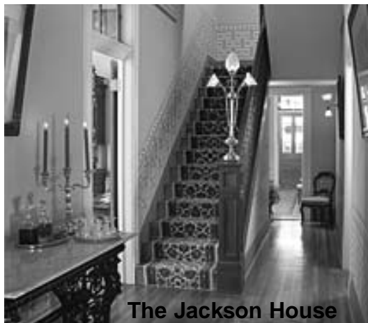
The Jackson House