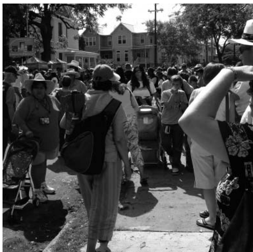
Congestion at E. Guenther and S. Alamo intersection

dents of one street more entitled to the parade than the residents of any other street? Does it matter whether the residents are members of the King William Association or not? Does it matter whether the residents are holding personal parties or volunteering to run the event? Does it matter which streets provided the largest number of Fair Chairs (Adams being first, followed by Madison, with a three-way tie among Crofton, Mission, and Guenther)?