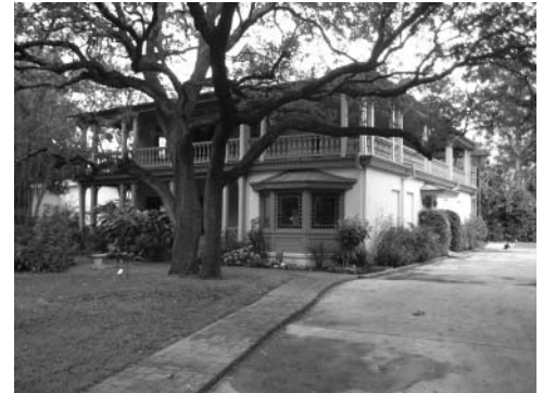
SA Art League & Museum, 130 King William