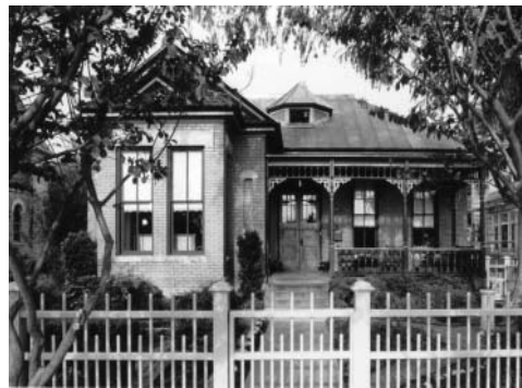
The Jackson House, 107 Madison