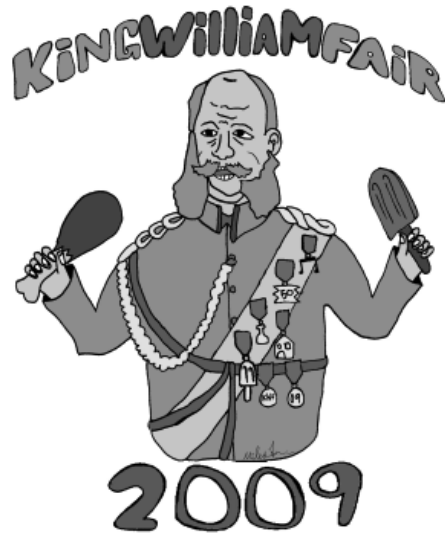
Kaiser Wilhelm I enjoys a turkey leg and paleta at the Fair!