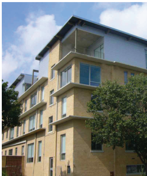
St. Benedict's, 1115 S. Alamo Street

St. Benedict's is now roughly 95% complete with the only remaining items being some minor finish work and straightening up of the grounds. As most of you know, abrupt changes in the condominium finance market last summer prompted the decision to lease the units until such time as mortgage lending returns to something closer to normal. The response to the rental program has been great and as of November 1, with Building 3 still pending completion, the project stood at roughly 60% leased.