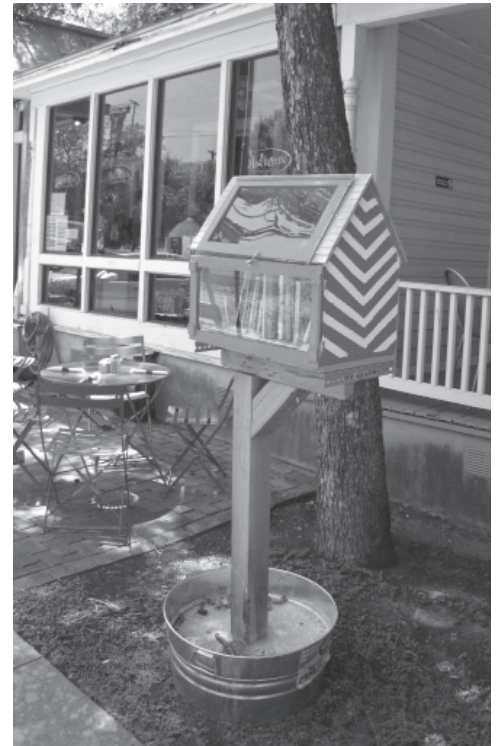
Little Free Library at Madhatter's

Girls Incorporated® of San Antonio Mentors Valuing Peers (MVP) program members spent their summer giving back to the community by building and installing a series of Little Free Libraries as part of the Summer Team Up Challenge sponsored by Silver & Black Give Back. At Girls Inc. we believe that readers today become leaders tomorrow, and our Little Free Libraries help our girls spread a love of reading and life-long passion for literacy in our community.