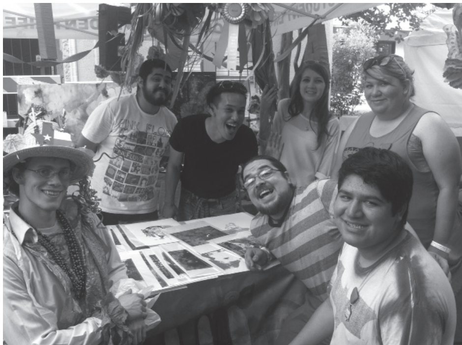
SAC Student Art Guild members at their booth at the 2014 KW Fair

The San Antonio College Student Art Guild has been an official campus club, serving art students for over 30 years. Our goal is to create an environment outside the classroom, for students to pursue creative projects, engage in art critical discourse, and build peer relationships that will nurture their creativity and strengthen the transition from student to professional artist.