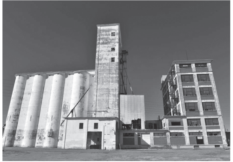
Liberty Flour Mill.

Both mills had been sharing the same brand names, but when the partnership ended, C. H. Guenther and Son reverted to their previous brands. The upstart mill, how-