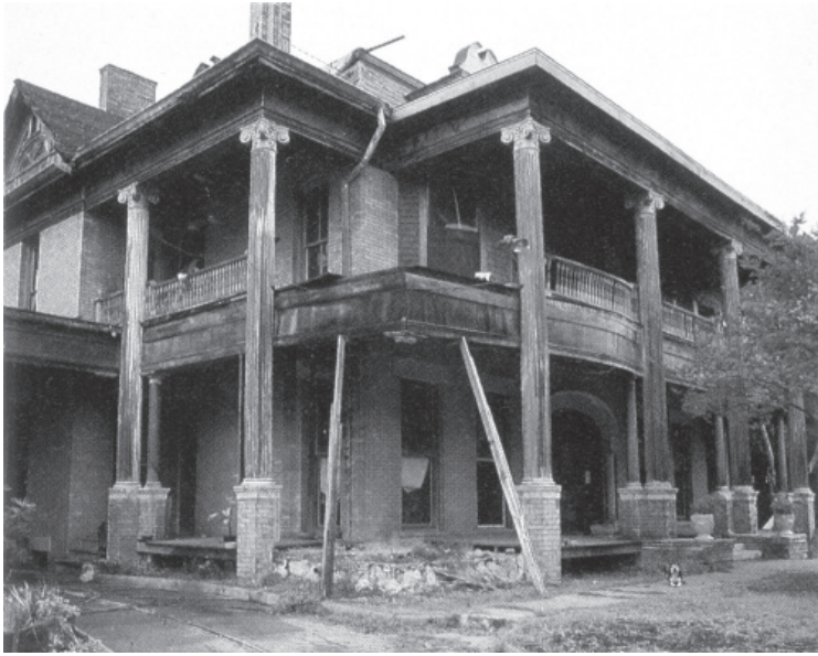
241 King William, 1980s