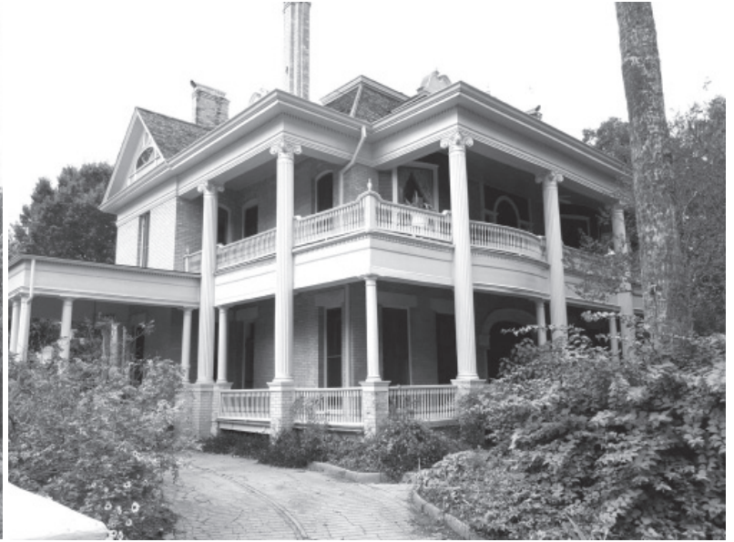
241 King William now