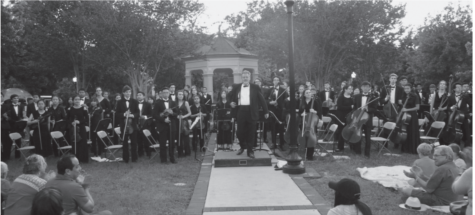
Youth Orchestra of San Antonio played for an appreciative crowd in October.