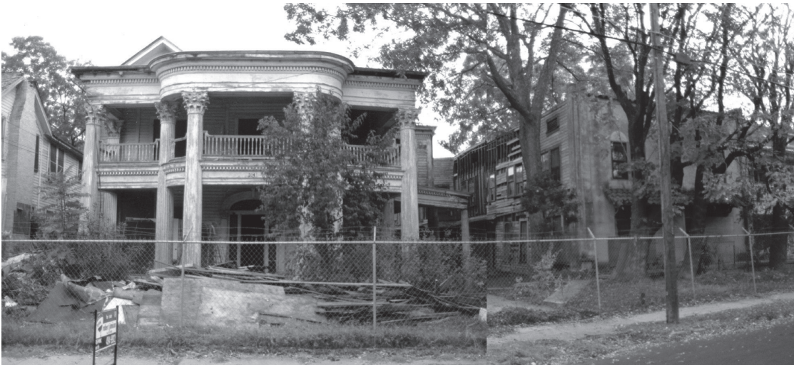
314 and 318 Madison Street, late 1980s.