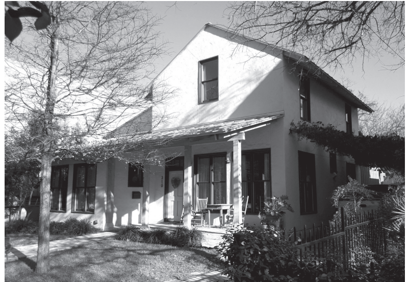
310 Madison, now

In 1987, the King William neighborhood was invaded by Hollywood when a short segment of the movie Nadine was being filmed in the 300 block of Madison Street. At first, the neighbors thought it was exciting to have the film crew working in the neighborhood, but after a few days of noisy generators humming away all night and bright flood lights late into the evening, the glamour quickly wore off.