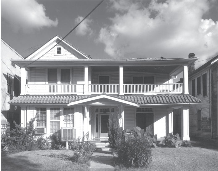
310 Madison, 1980s