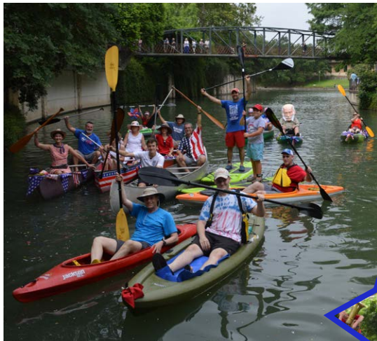
Regatta participants celebrate at the finish line