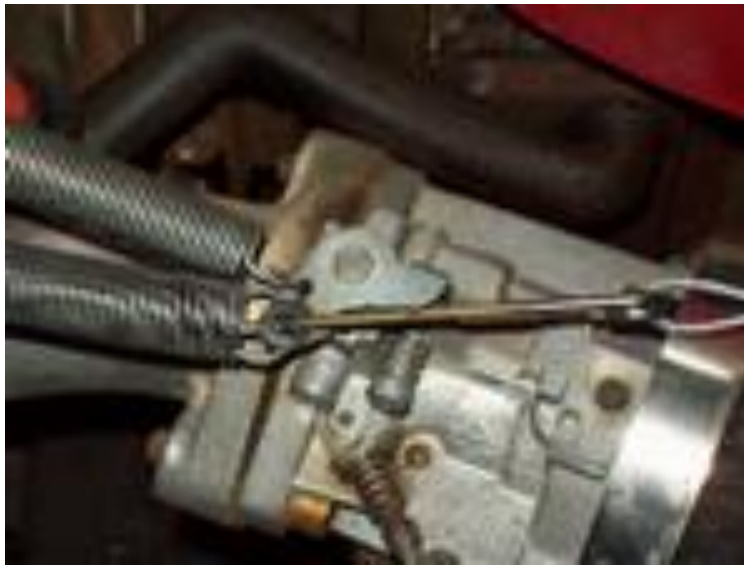
Photo 2: Notice that the springs are attached to the same bracket this is incorrect! They must be mounted on two separate mounting brackets. This way if for any reason one breaks you will still have one spring attached. For V-twins and different style carburetors' used on FX's, the same principle must be used. For example FX's using Mikuni or the CV style Keihin Carburetors the Slide Spring can count as one return spring and you must have a separate external spring attached as the safety spring.