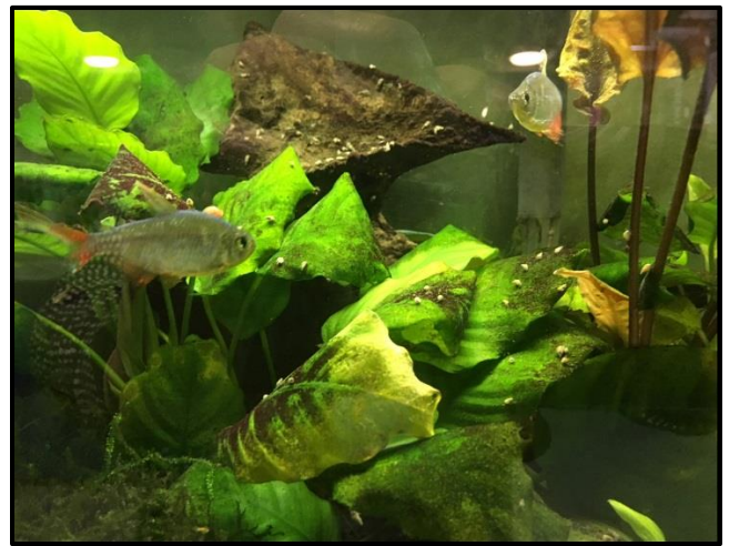
The Hobbyist Youth Best of Show was Ethan Skidmore from Tampa.