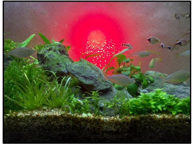
The Aquarium Beautiful Best of Show was Ricardo Cervantes from Ruskin.