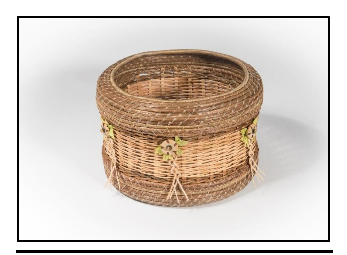
The Basket Weaving Best of Show winner was Darien Wyckoff from Largo.

Design in relationship to materials used