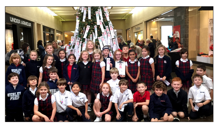
Two 5th-grade classes from Wesley Prep in Dallas adopted eight Angels, shopped for the gifts, and returned them to our Angel Tree at North Park Center.