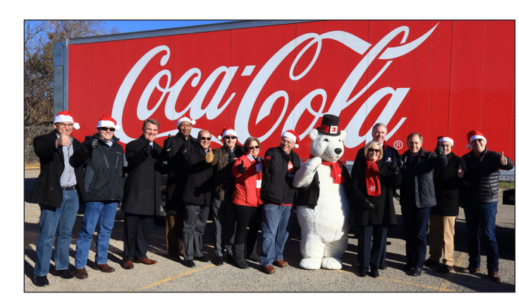
Volunteers from Coca-Cola unloaded Christmas gifts donated by nearly 800 employees for 1,300 individuals from two 45-foot Coke trucks at our Dallas Christmas Center.