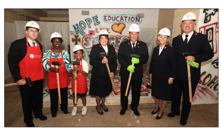
We ceremonially smashed down a wall at our community center in Pleasant Grove to launch a major renovation there. When complete, the facility will have a state-of-the-art sports complex, a completely remodeled worship space, a new food pantry, and more parking available for people to access services at the center.