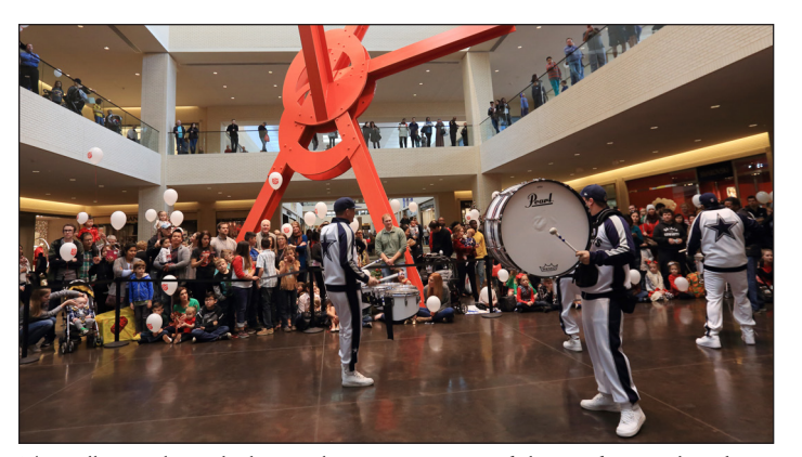
The Dallas Cowboys Rhythm & Blue Drum Line roused the crowd at North Park Center during our Angel Tree Extravaganza on the day after Thanksgiving.