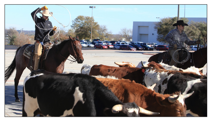
In true Cowtown fashion, a group of cowboys on horseback drove a small herd of cattle one mile around Ridgmar Mall to officially kick off The Salvation Army's red kettle campaign in Fort Worth.