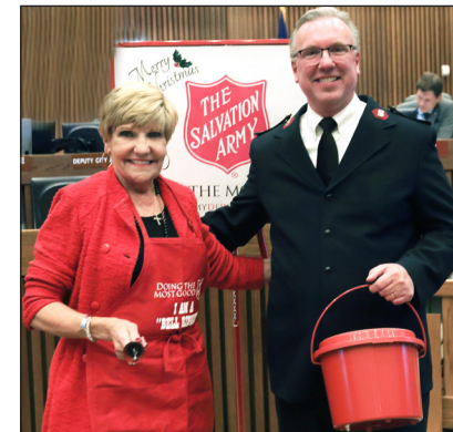
Fort Worth Mayor Betsy Price put a donation into a red kettle at the Fort Worth city council meeting in December. Mayor Price also collected donations from the members of the city council.