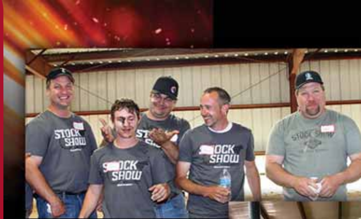
We work hard and play hard at Stock Show U ... World Championship Cupcake Eating Contest

Iowa Stock Show University GRAD Program May 2014