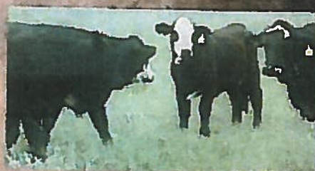
Brangus Baldies - Breds and Pairs!