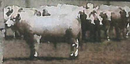
Charolais Bulls - Bred and Raised in South Texas... The Rancher's Kind!