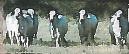
Outstanding Set of Registered Brahman Heifers Sell!