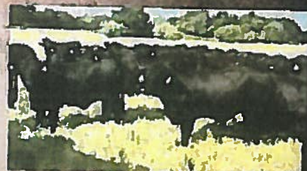
Over 100 Plus Quality Bred Brangus Females Sell!