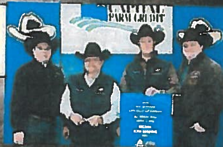
Hereford Bulls from a Proven Championship Herd!