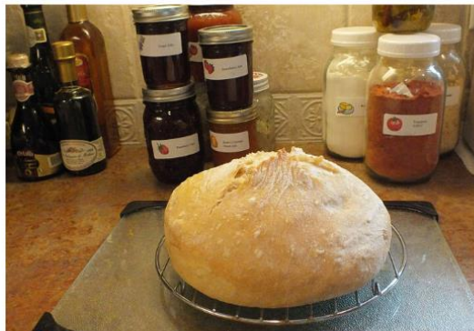
Bread from the oven! Oh so good!