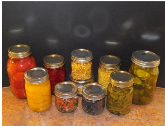
Summer's Bounty Canning is fun!