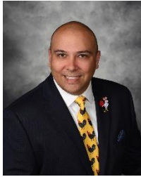
Director in Charge