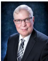
Director in Charge