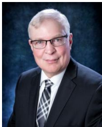
Director in Charge