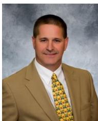
Director in Charge