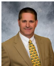
Director in Charge