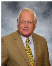
Director in Charge