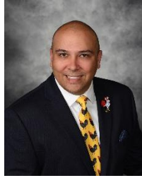
Director in Charge