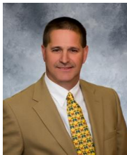
Director in Charge