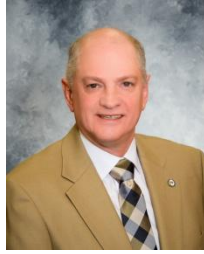
Director in Charge