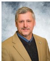
Director in Charge