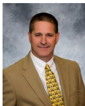
Director in Charge