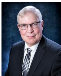
Director in Charge