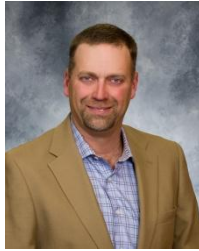
Director in Charge