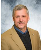
Director in Charge