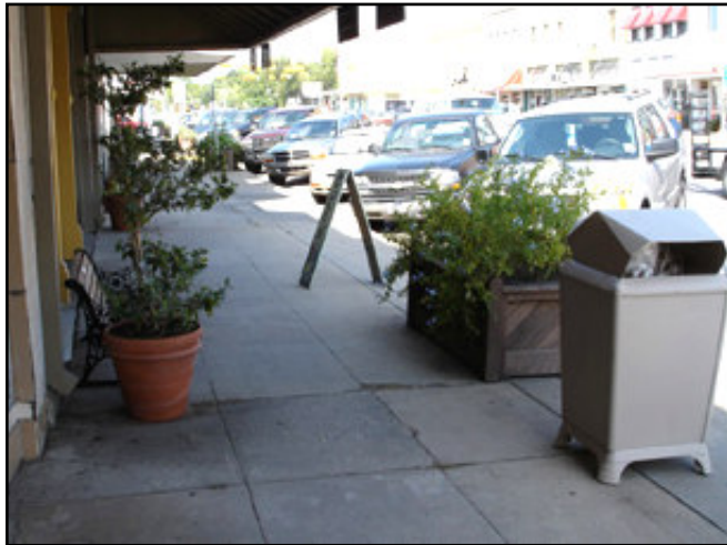
Downtown Navasota Streetscape

Adequately illuminated areas provide a sense of comfort and attraction to pedestrians. The Comprehensive Plan recommends providing a street lighting program, which will extend the hours available for use and activity and provide a