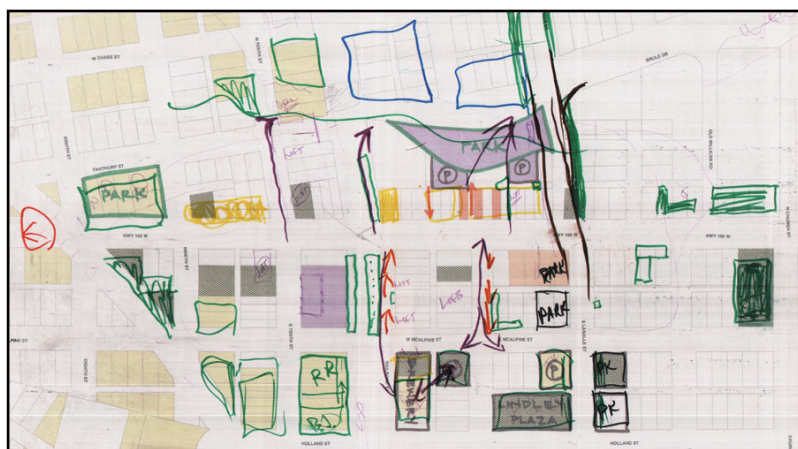
Public Design Workshop Participant Sketch

well as master gardeners and concerned citizens attended the design workshop. The participants were divided into three teams of approximately four to five