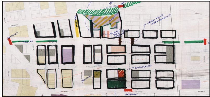
Public Design Workshop Participant Sketch

After the team presentations, common ideas were identified between the three plans. The urban design team then looked at ways to combine and expand upon the ideas generated at the workshop. Several more site visits were made to brainstorm additional ideas for developing the Concept Plan.