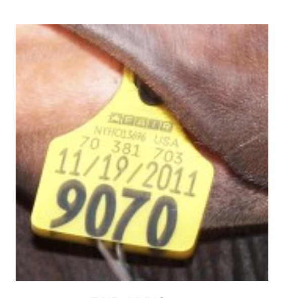
FAIR, NYHO tag