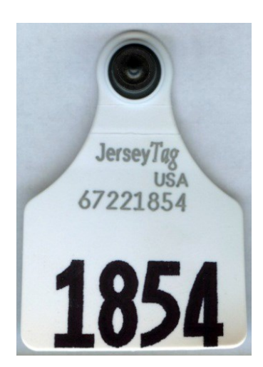
Breed Association tag