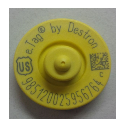
15-digit 985 series tag

Animals with breed association or manufacturer tags applied after this date will have their health papers <u>rejected</u> at NY Fairs and Shows.