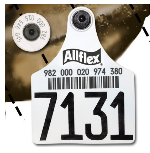
15-digit 982 series tag