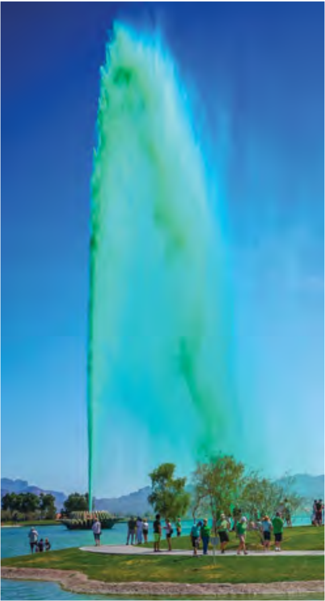
St. Patrick's Day

OKTOBERFEST Fountain Park September 25 - 26, 5pm - 10pm fountaineventsfh.com