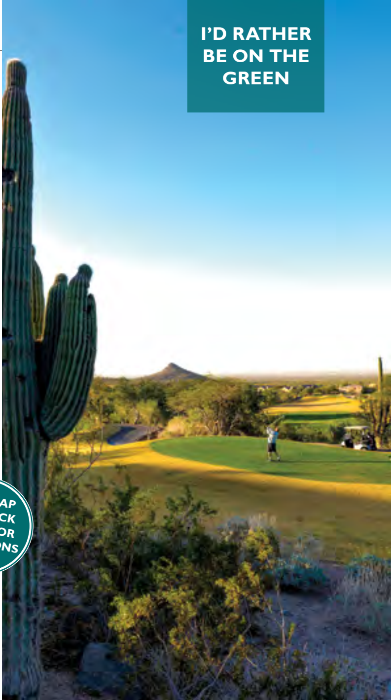
Eagle Mountain Golf Club