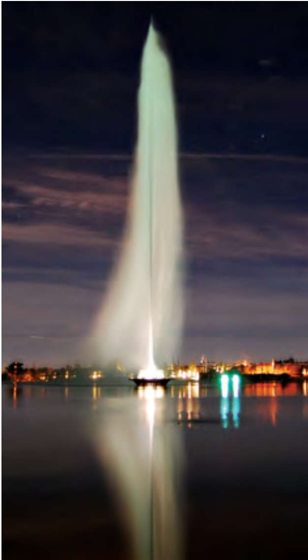
Rebecca Sayers (Flickr)

At its full height of 560 feet, the fountain in the center of Fountain Hills is higher than the Washington Monument. It is 10 feet taller than Notre Dame Cathedral, 110 feet higher than the Great Pyramid of Cheops in Egypt and three times as high as Old Faithful in Yellowstone Park. The fountain is the focal point for community celebrations and the pride of its residents. If you happen to visit during the St. Patrick's Day celebration, you'll see the fountain transform to bright emerald green. The fountain is extended to its full height on special occasions. For everyday viewing, the fountain reaches a height of 330 feet!