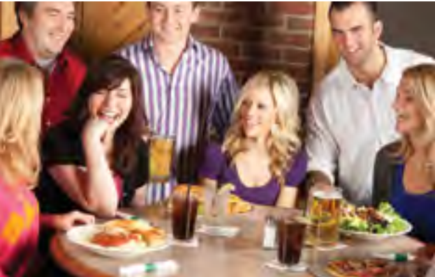
Fort McDowell Casino