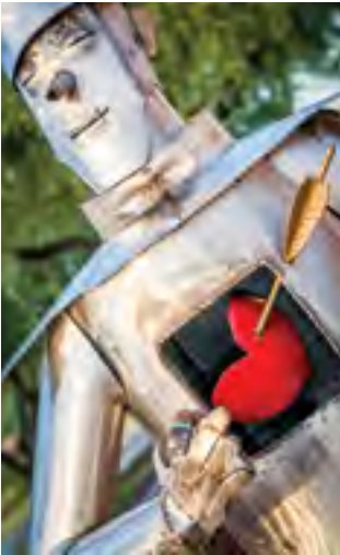
Fountain Hills public art

In addition to our docent-led tours, Fountain Hills offers self-guided amenities for all four of our Art Walk tours. In the