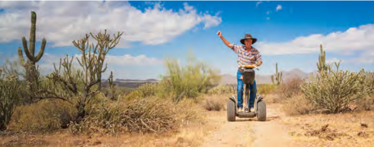
Adventures Out West – Segways at Fort McDowell

14821 N. Hiawatha Hood Road, 800.755.0935, advoutwest.com