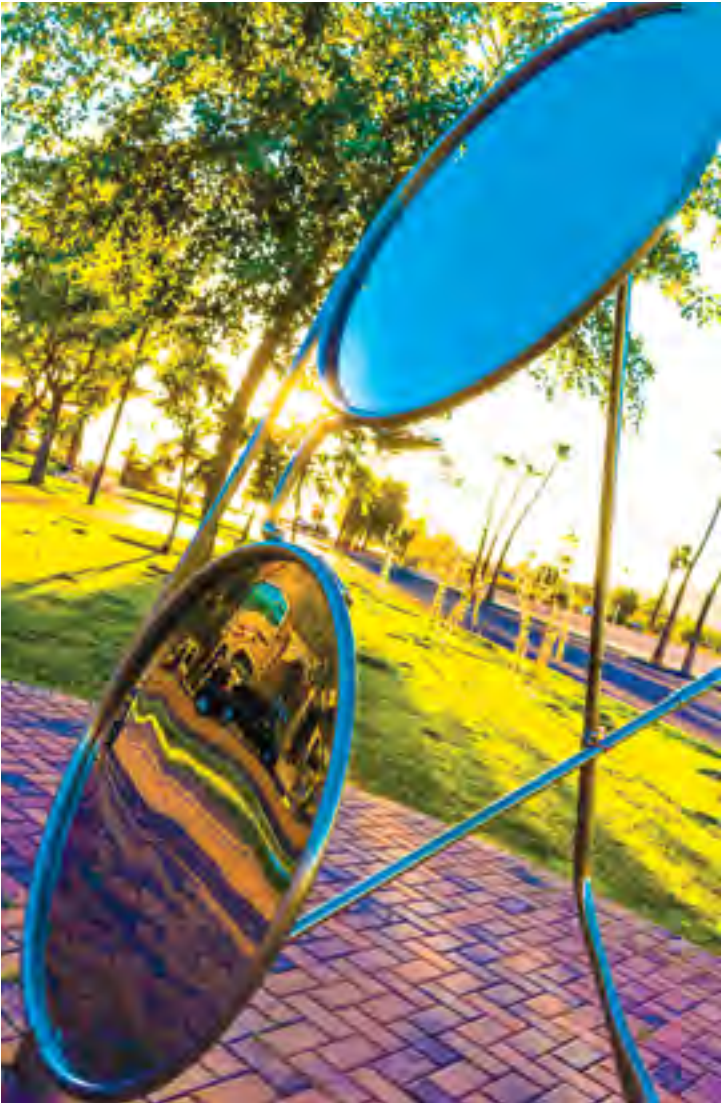
Fountain Hills public art

Grab a paddle and start your adventure! Explore the cultural and natural history of the lower Verde River valley through a variety of interactive exhibits, hands on activities, and public programs. Discover settlements and ancient cities and learn about the ongoing development of planned,