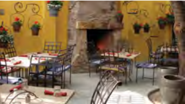
El Encanto Mexican Restaurant