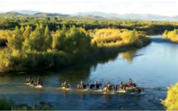
Fort McDowell trail ride

For family friendly fun, jump from sprinkler to sprinkler in our splash pad, or spread out your blanket for a Movie in the Park! Fountain Hills features four different parks for your outdoor recreation enjoyment! Get outside and enjoy any of our parks including: Desert Vista Park, Fountain Park, Four Peaks Park and Golden Eagle Park. The Town of Fountain Hills has been described as one of the most pet friendly towns in the valley. So bring your furry friends to Desert Vista Dog Park and play the day away!