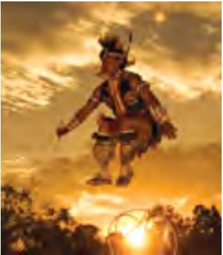
Native – Festival of Tribal & Arizona Arts & Entertainers

BALLOON GLOW Fountain Park December 28, 5:30pm-7:30pm experiencefountainhills.org