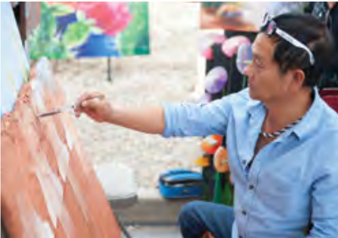
Fountain Festival of Arts & Crafts

MOVIE IN THE PARK Four Peaks Park November 16, 7pm - 9pm fh.az.gov