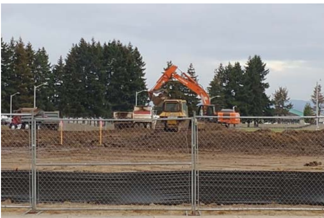
Site work begins. (September 2018)