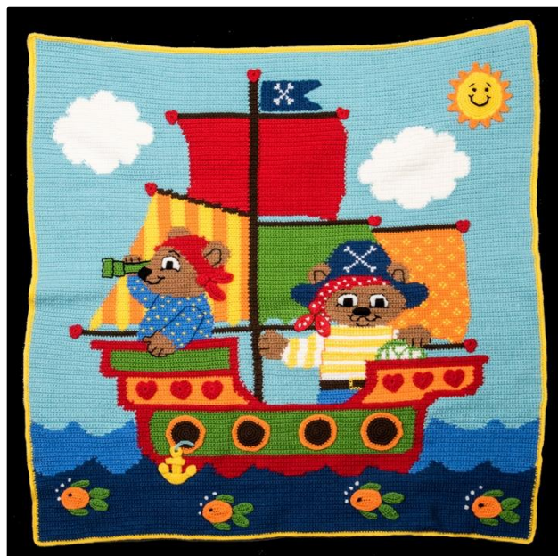
The Crochet Best of Show was Eileen Rogers from St. Petersburg.