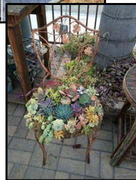
Succulents in Alternative Planters