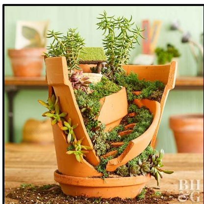
Cracked Pot Gardens