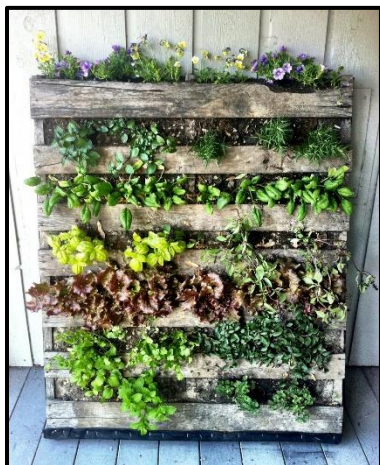
Wood Pallet Planters