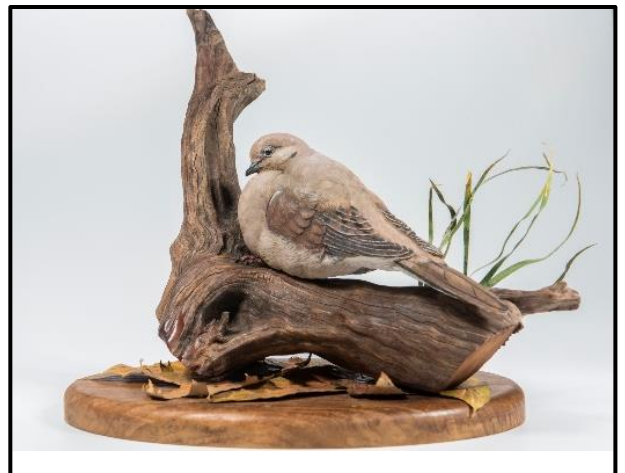
The Woodcarving Advanced - Best of Show was June Longe from Ocala.