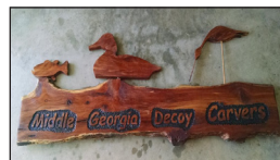
Middle Georgia Decoy Carvers, Warner Robins Oct. 8