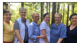
Seven Oaks Porcelain Painters, Atlanta Oct. 6-7

Three years ago, she began growing gourds on her farm and incorporated them into her artwork. From chicken sculptures to life size ladies, the gourds have become a whimsical style of art that is sure to put a smile on your face.