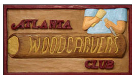
Atlanta Woodcarvers Club Oct. 4-5

Each year the Georgia National Fair invites selected artists to participate in our Artists in Residence program. The goal of the program is to expose the fairgoers to the arts through demonstrations and interaction with these artists. Artists in Residence are traditionally selected from previous winners of the competition.