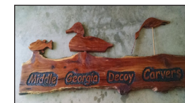
Middle Georgia Decoy Carvers, Warner Robins Oct. 8-10