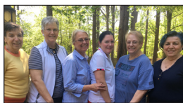
Seven Oaks Porcelain Painters, Atlanta Oct. 4-6

suburban clubs. AWC collaborates with other metro clubs in joint projects such as staffing an Atlanta woodcarving booth at the annual Southeast Woodworking Show. Please visit www.atlantawoodcarvers.com for more information.