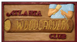
Atlanta Woodcarvers Club Oct. 3-4

My work can be seen at the Fine Art Society Gallery, The Painted Door Gallery, both in Warner Robins, Georgia and the Sunshine Gallery in Watkinsville, Georgia.