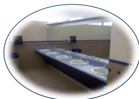
Large Clean Restrooms