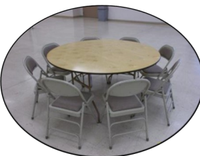
Padded Chairs, Round and Rectangular Tables that seat 8 Available

The Floral Building is another excellent building available for family events or class reunions.