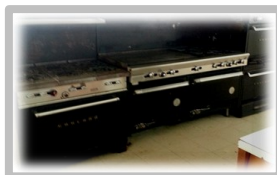
Large Commercial Kitchen