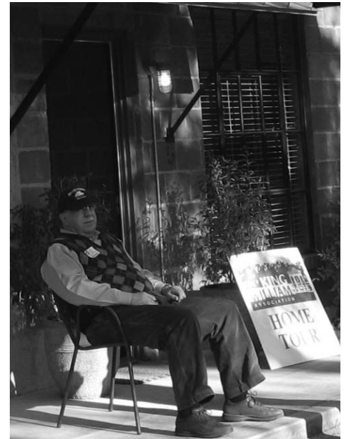
Volunteers hard at work.

We had another successful Home Tour thanks to a phalanx of volunteers.