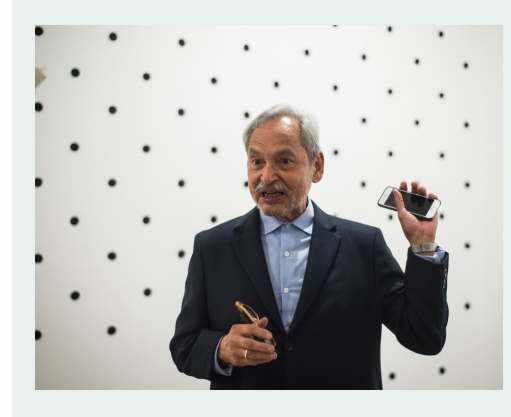
December First Friday Friday December 7, 2018 | 10 AM - 9 PM

Bring your friends and family to enjoy our fall exhibitions for FREE, including Monarchs: Brown and Native Contemporary Artists in the Path of the Butterfly, which takes the migration path of the Monarch butterfly, as a geographic range and a metaphor.