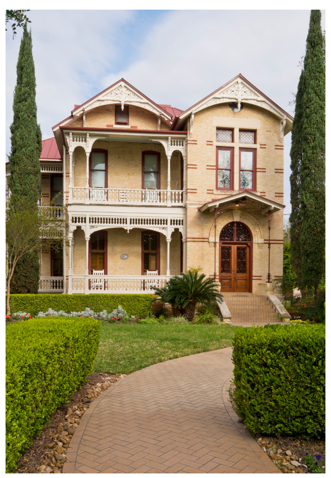
The Harnish House, 523 King William.

The six homes and one commercial building will be open from 11 am to 5 pm on Saturday, December 1. Tickets are available online at www.ourkwa.org for $25 until November 30, 2018; after that, tickets can be purchased at 122 Madison or 524 King William. A ticket admits you to all of the houses, Villa Finale and the San Antonio Art League, and entitles you to buy a copy of the book "The King William Area" for $20.