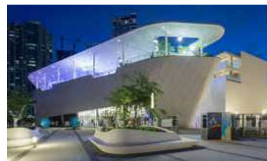
FROST SCIENCE CENTER AND PLANETARIUM

RESERVATIONS CAN BE MADE AT thejuliahotel.com , bigpinkmiamibeach.eat24hour.com , brickellcitycentre.com , cibowinebar.com , frostsience.org , miamiculinarytours.com , thewynwoodwalls.com