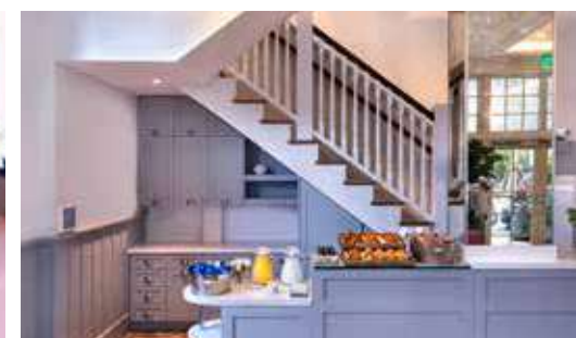
THE JULIA – BREAKFAST