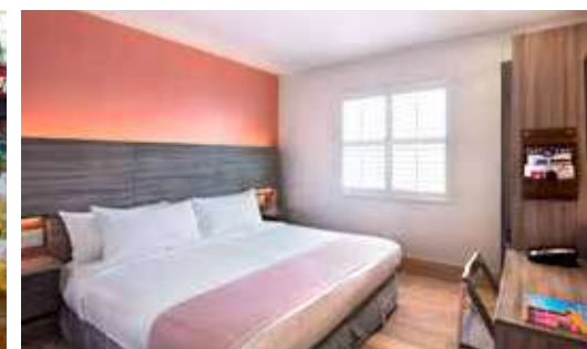
THE JULIA – FLAGLER KING