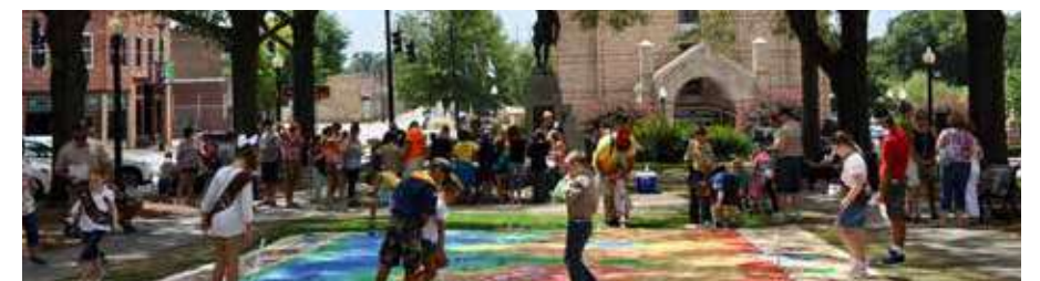
FUN IN DOWNTOWN NEWBERRY IN FRONT OF OPERA HOUSE

in that magnificent building.) Each February the Opera house actually brings in an opera.