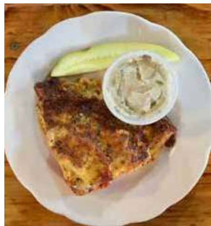
QUICHE LORAINNE AT LITTLE MOUNTAIN ANTIQUES CAFE

It's a short drive from Atlanta up I-85 to I-26. Take the toll around Greenville. Lake Murray is surrounded by Newberry, Lexington, Richland and Saluda counties. Visit: lakemurraycountry.com