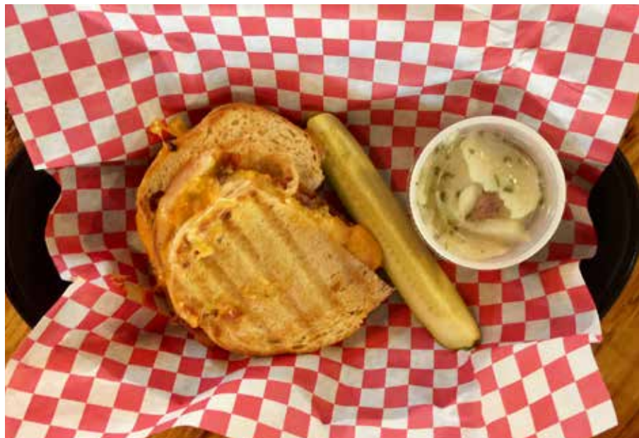
PBJ – PIMENTO CHEESE, BACON AND RASPBERRY-JALAPEÑO JELLY – WORTH THE DRIVE

enough, but now that I know about this little nugget, I bet I can entice a few girlfriends to go up for shopping and lunch.