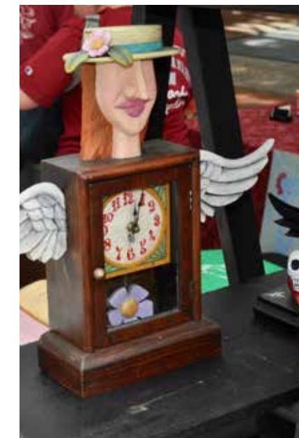
ARTISANS SELL THEIR CRAFTS AT SODA CITY