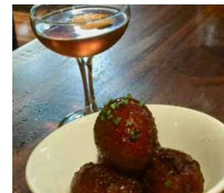
FRANKLY MY DEAR, BOURBON GOES GREAT WITH JALAPEÑO HUSH PUPPIES AT BOURBON BAR

While downtown, meander over to Bourbon, a happenin' whiskey bar and Cajun-Creole restaurant. The establishment has more than 350 whiskeys, most of which are bourbon, rye or Tennessee whiskey. Each concoction comes with a unique name. I'm not usually a bourbon drinker, but being from Atlanta I had to order the “Frankly, My Dear,” made with Maker's Mark, vanilla syrup, black walnut bitters and flamed orange. Yes, it was delicious. When you find your special drink make sure you get an order of Jalapeno hush puppies. They go great with everything. I'd love to have them send me an order right now! MORE ►