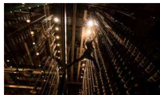
CIBO WINE ANGEL