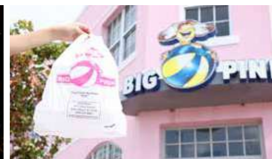
BIG PINK TAKEOUT