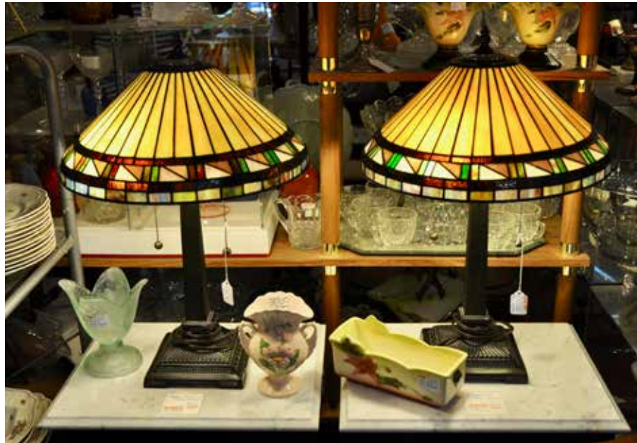
A FEW LITTLE MOUNTAIN FINDS

So what was going to be a short visit to Little Mountain Antiques on our way home turned out to be a half-day of browsing, eating and yes, making a purchase. Even half-day wasn't long