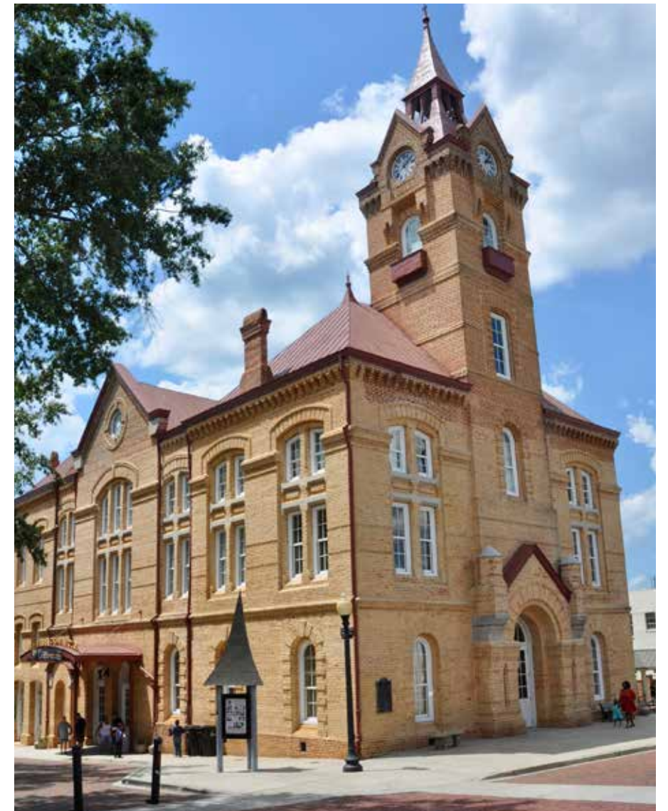
HISTORIC OPERA HOUSE IN DOWNTOWN NEWBERRY

The Opera House has now become nationally and internationally known and respected. So much so that other performing art centers are watching how a small town of around 10,000 can bring entertainment and educational programs that include the likes of Sawyer Brown, The Coasters, The Marshall Tucker Band, Arlo Guthrie and The Atlanta Pops. (An interesting tidbit is that a Japanese businessman flew over this year just to see the Atlanta Pops Orchestra