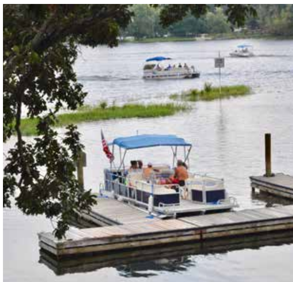
BOATS GETTING READY FOR ECLIPSE ON LAKE MURRAY