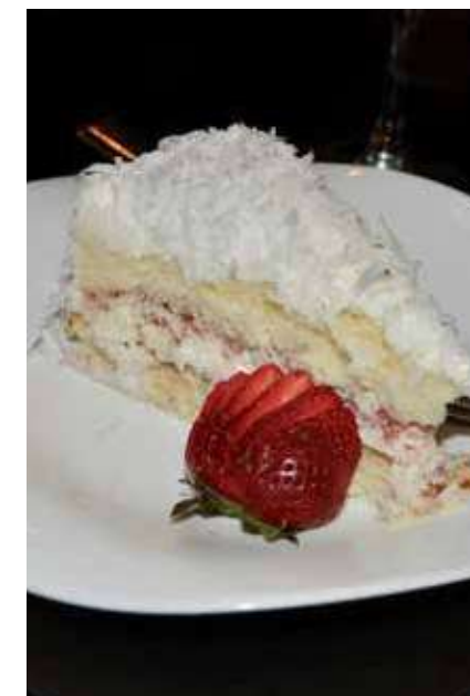
YUMMY HOMEMADE COCONUT CAKE AT FIGARO