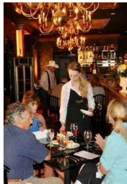
ONCE A BANK, ITS VAULT IN BACKGROUND NOW HOUSES FINE WINES. FLOWERS SIT ON BEAUTIFUL WOODEN ORIGINAL TELLER WINDOW.