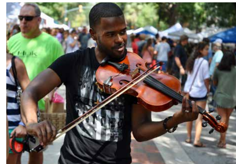
SATURDAYS MEAN SODA CITY. STREETS ARE BLOCKED OFF FOR FUN ATMOSPHERE IN DOWNTOWN COLUMBIA.