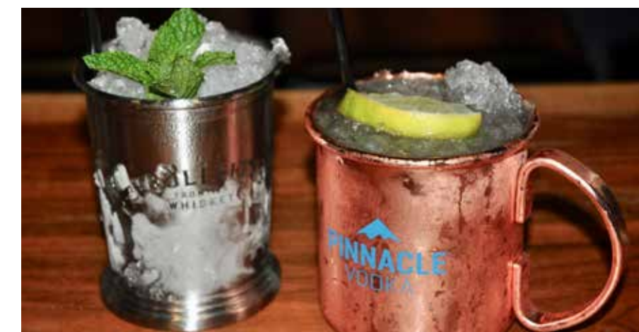
ONE OF THE HOUSE BOURBON SPECIALS – MINT JULEP