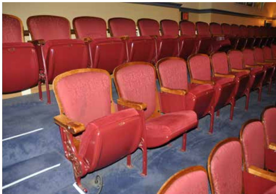
PENELOPE'S GHOST SEAT AT NEWBERRY OPERA HOUSE

As is the case with many historic buildings, the Opera House apparently has a ghost — named Penelope. The story is told that young Penelope fell in love with a traveling vaudevillian, “The Professor.” They exchanged messages to each other in a book at the local bookstore and their love bloomed. Excited to see the world and young and in love, Penelope decided to run away with him. In his last note he tells her to wait for him at her seat in the balcony after his last performance. Penelope snuck out of her parent’s house and waited. As time went by she realized that he is not coming. She died soon after but, even today, there are those who claim to have seen the ghost of Penelope waiting for her beloved at Balcony Section A Seat 111. The seat can always be found turned down every performance no matter how many times it is placed back up.