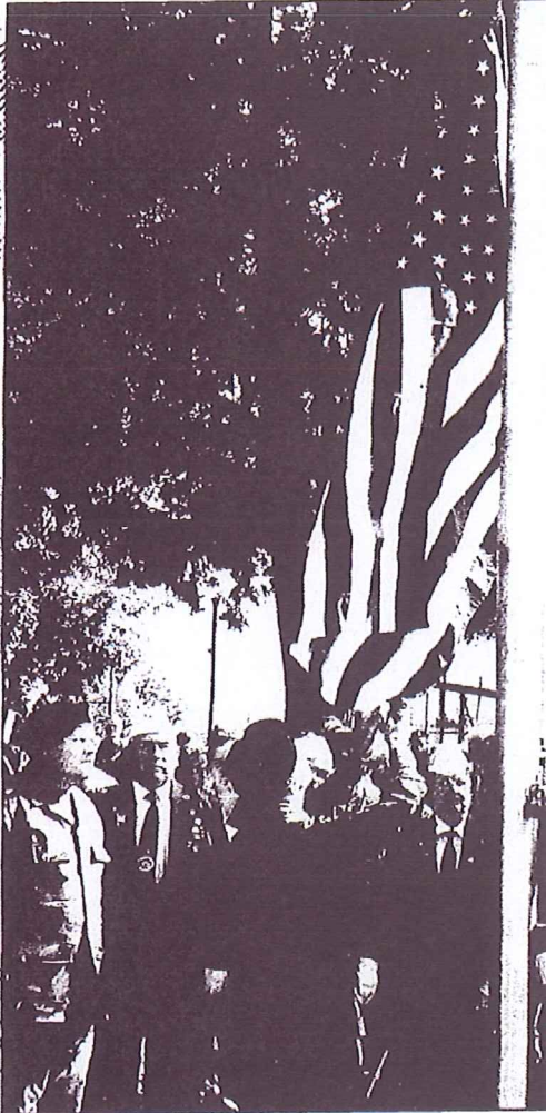
RAISE THE FLAG

A mixed honor guard of Lovington and Hobbs American Legion and National Guard, raise the flag at war memorial dedication services.