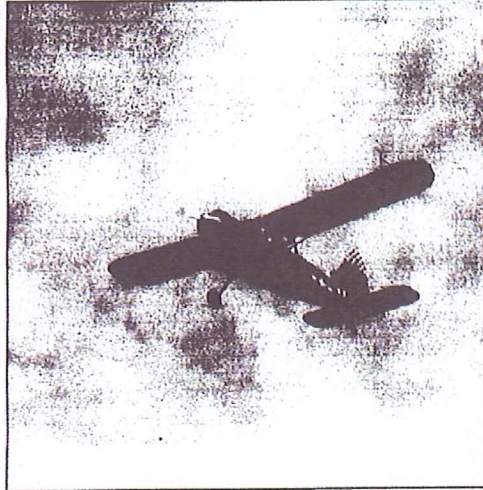
MISSING MAN FORMATION

A mixed honor guard of Lovington and Hobbs American Legion and National Guard, raise the flag at war memorial dedication services.