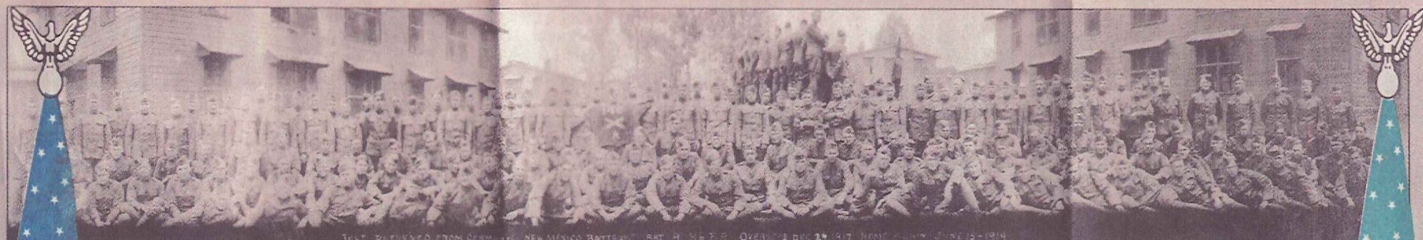
Just returned from Germany. New Mexico Battery: Battery "A", 146 F.A. Overseas Dec. 24, 1917, Home Again, June 15, 1919