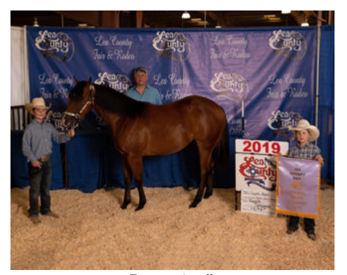
Trippton Angell Reserve Grand Champion Filly Tatum 4-H