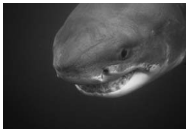
Great White Sharks attacks are known to occur at Stinson Beach. Please refer to the signs for more information.