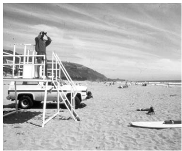
Stinson Beach lifeguards are on duty from late May to mid-September.