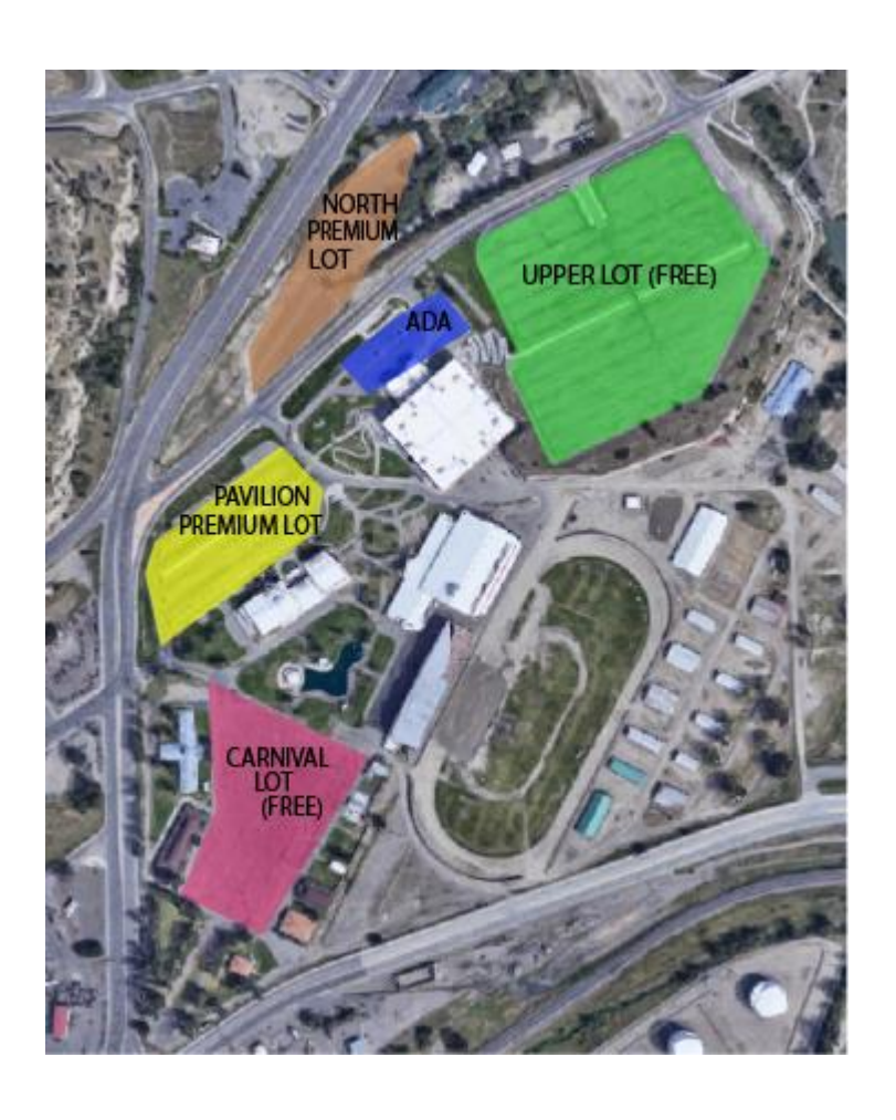
PAVILION (LOWER) LOT