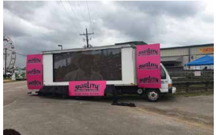
Quality Insulation Jumbotron Truck