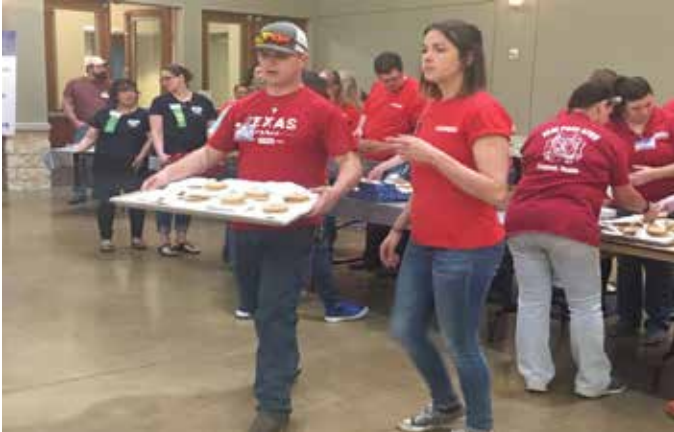
HEB Senior Citizens Day