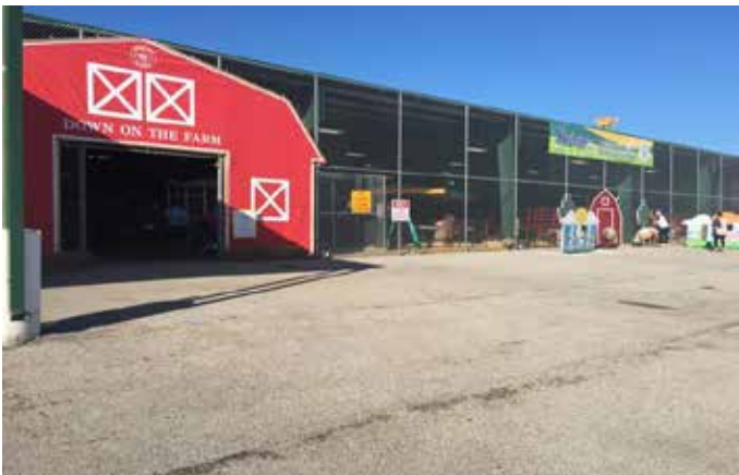
Buckalew Chevrolet Ag Knowledge Educational Exhibits