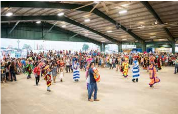
Bud Light Silver Eagle El Dia de La Familia Hispana