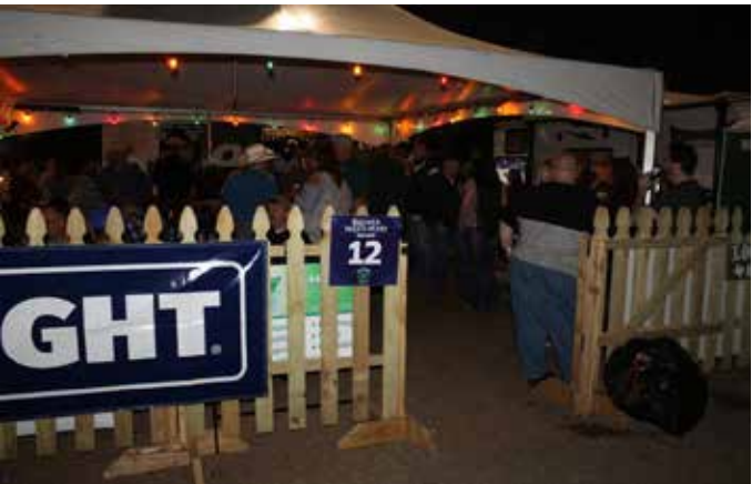
Bud Light Silver Eagle BBQ Cookoff