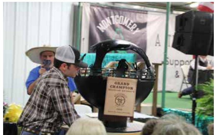
Tommy's Paint and Body Jr. Non-Livestock Show Awards