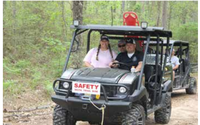
Montgomery County Hospital District Safety Services