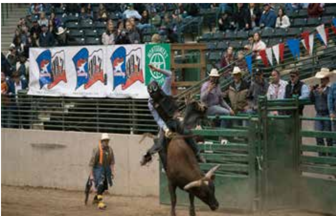
KSTAR Rodeo Announcers Stand