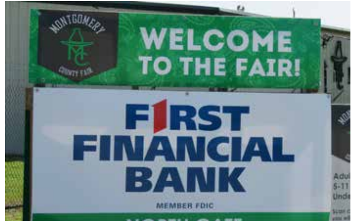
First Financial Bank North Gate