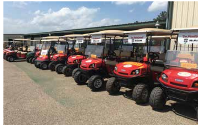
Demontrond Dodge Ram Grounds Transportation