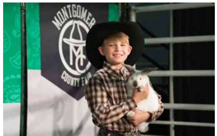
HCN The Courier Advertising Partner