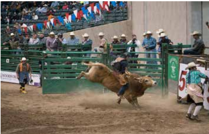
Waste Connections Rodeo Events