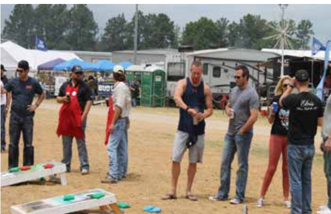
Gulf Coast Flooring Special Events - BBQ Cookoff