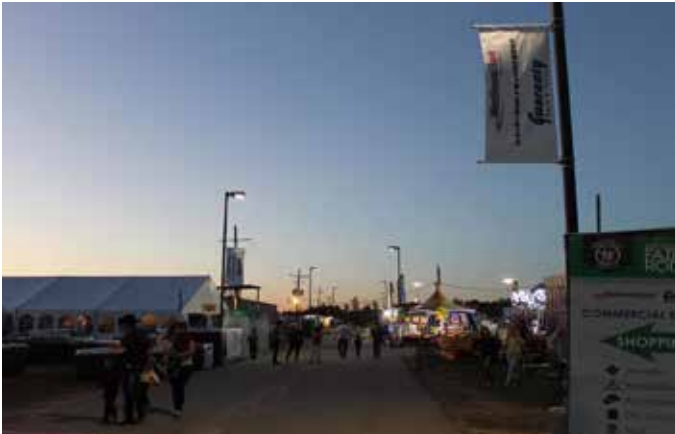
Westbound Bank/Guaranty Bank Commercial Exhibits