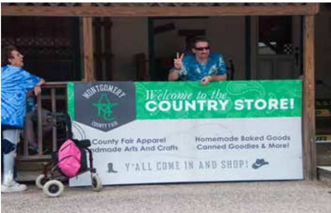
Keating Honda Country Store