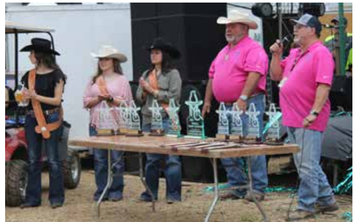
Gacey's Commercial Cleaning Services BBQ Cookoff Awards