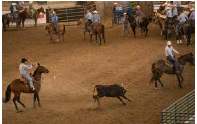
Double J Construction & Finway Electric Clash of The Counties Roping