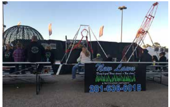
New Lawn Motorcycle Stunt Show