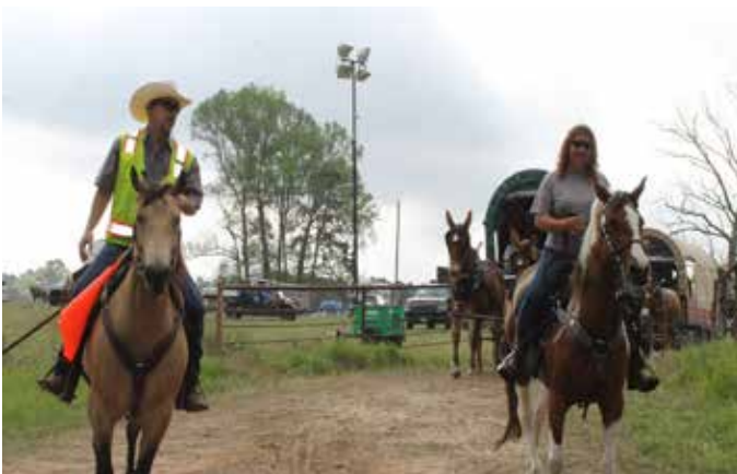
Sunbelt Rentals Lighting and Equipment Services