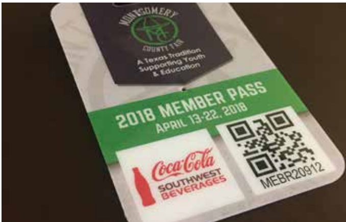
Coca Cola Badge Sponsor