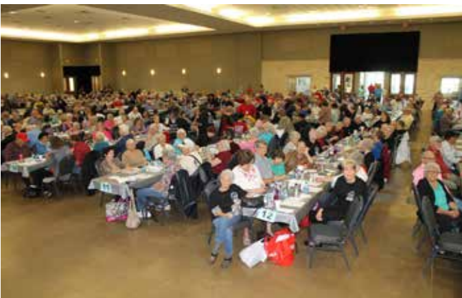
Eickenhorst Funeral Services Senior Citizen's Day