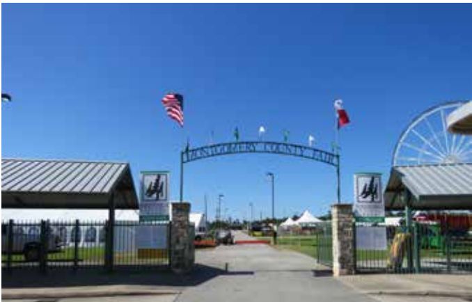
Woodforest National Bank South Gate