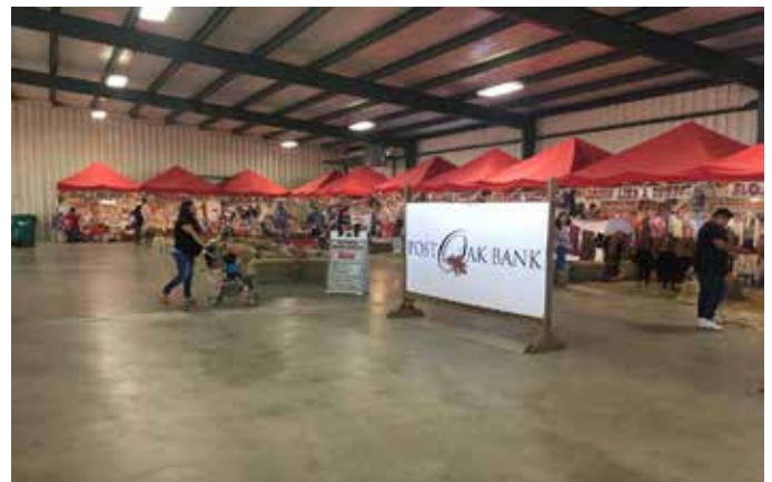
Post Oak Bank Cowboy Bootcamp