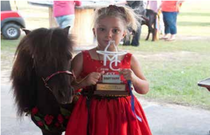
Premium Leisure Hot Tubs Pet Parade