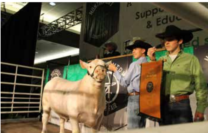
Keystone Concrete Livestock Auction