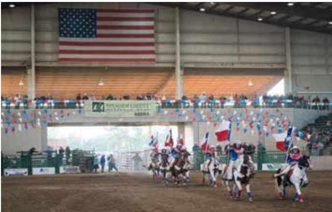
Woodforest National Bank Arena