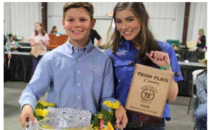
Wiesner Auto Group Non-Livestock Auction