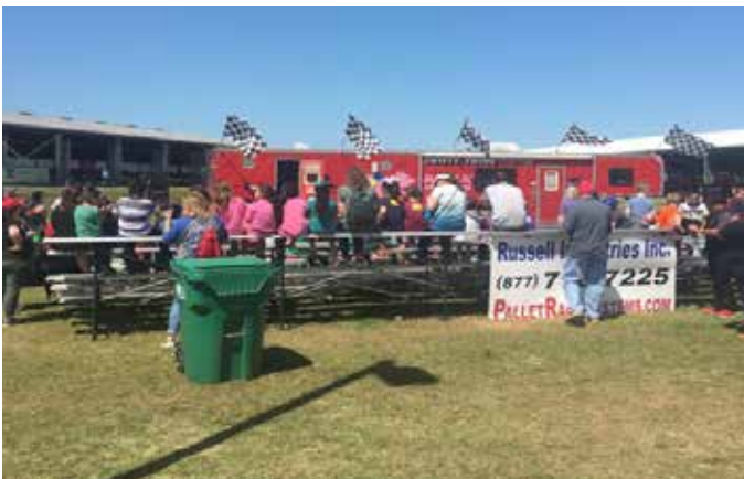
Russell Industries Swiftly Swine Pig Races