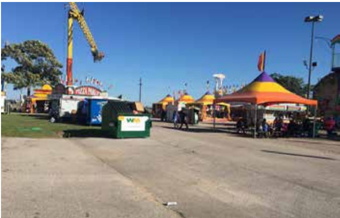
Waste Management Sanitation Services