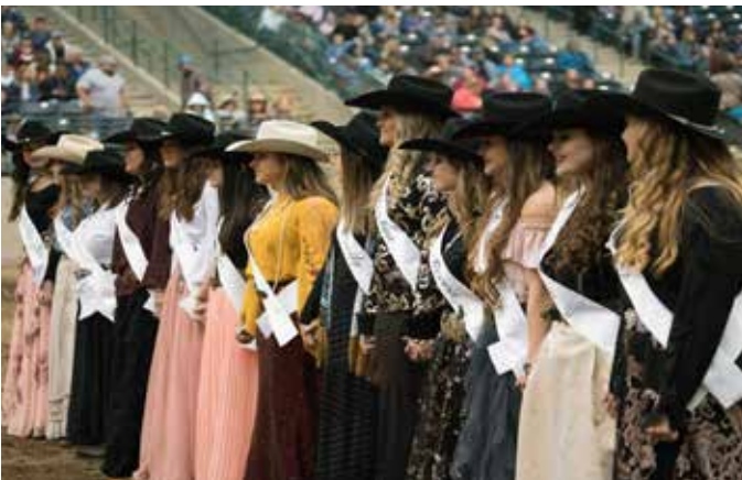
Montgomery Trailer Fair Queen Contest