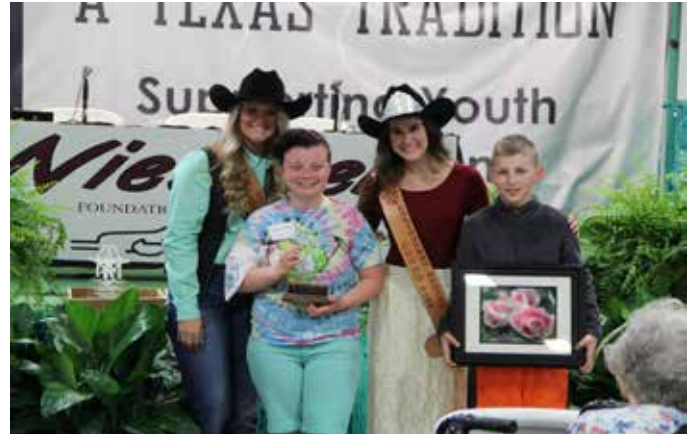
Congressman Kevin Brady Special Education Show