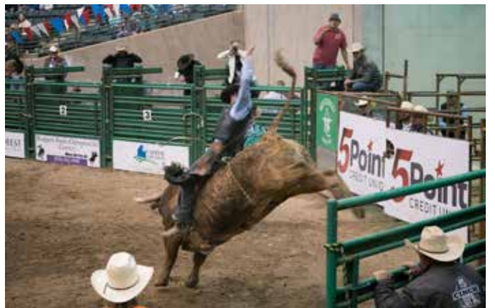
5Point Credit Union Let Out Gate