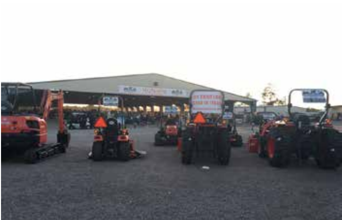
Lansdowne Moody Kubota Livestock Barn