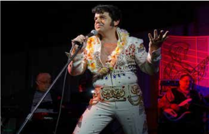
Entergy Elvis and the Legends Show