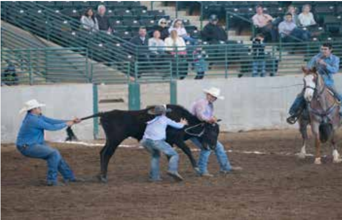
MidSouth Synergy Ranch Rodeo