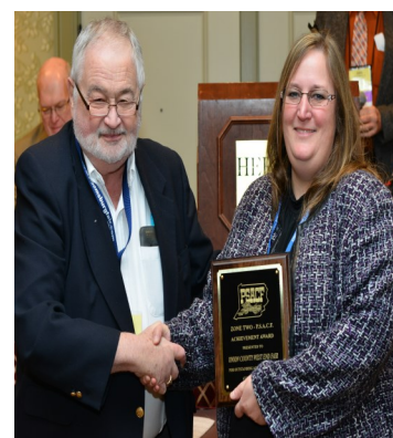
Zone Two Fair of the Year Union County West End Fair