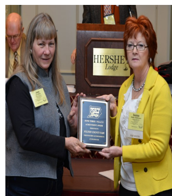
Zone Three Fair of the Year Fulton County Fair.