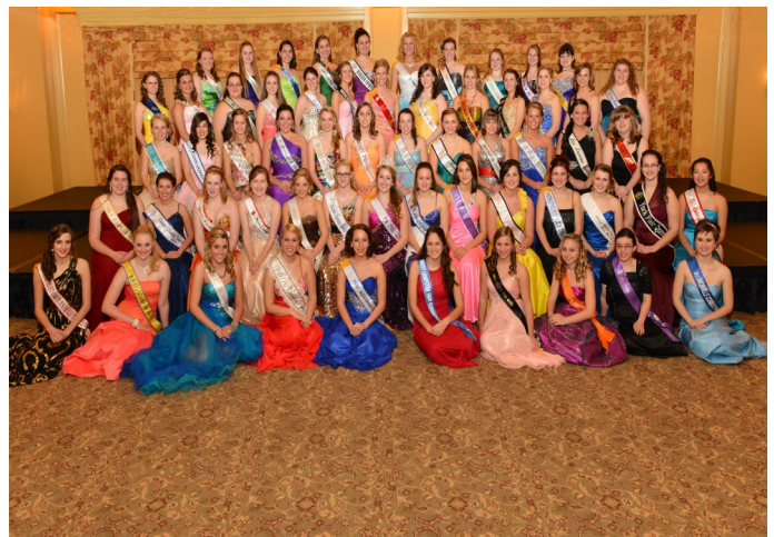
Queen Group Photo