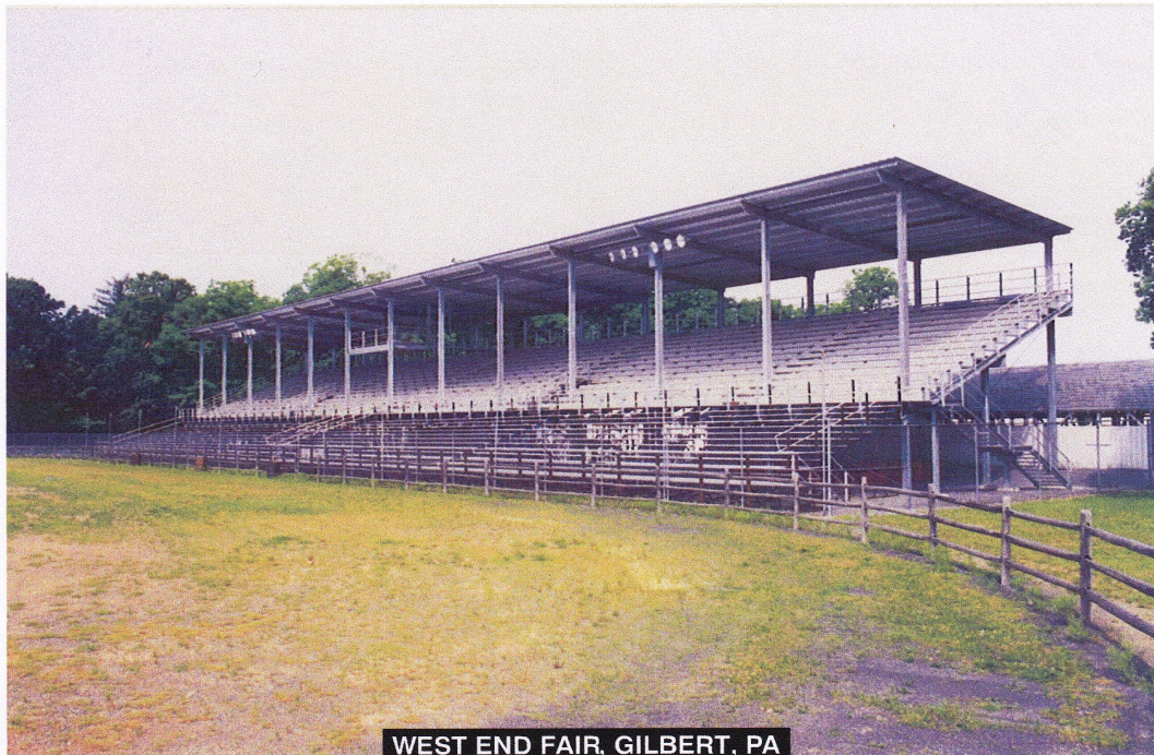
WEST END FAIR, GILBERT, PA