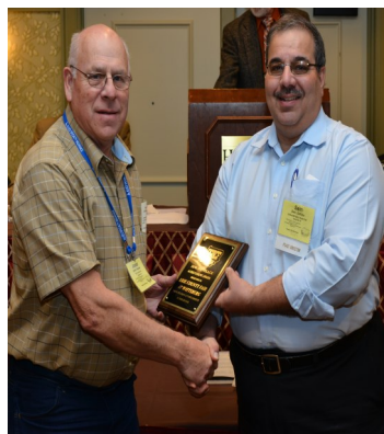
Zone One Fair of the Year Wattsburg Erie County Fair.