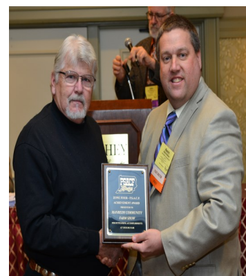
Zone Four Fair of the Year Manheim Community Farm Show