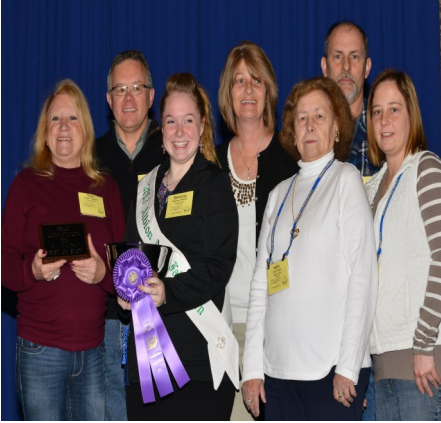
Best in Show — Albion