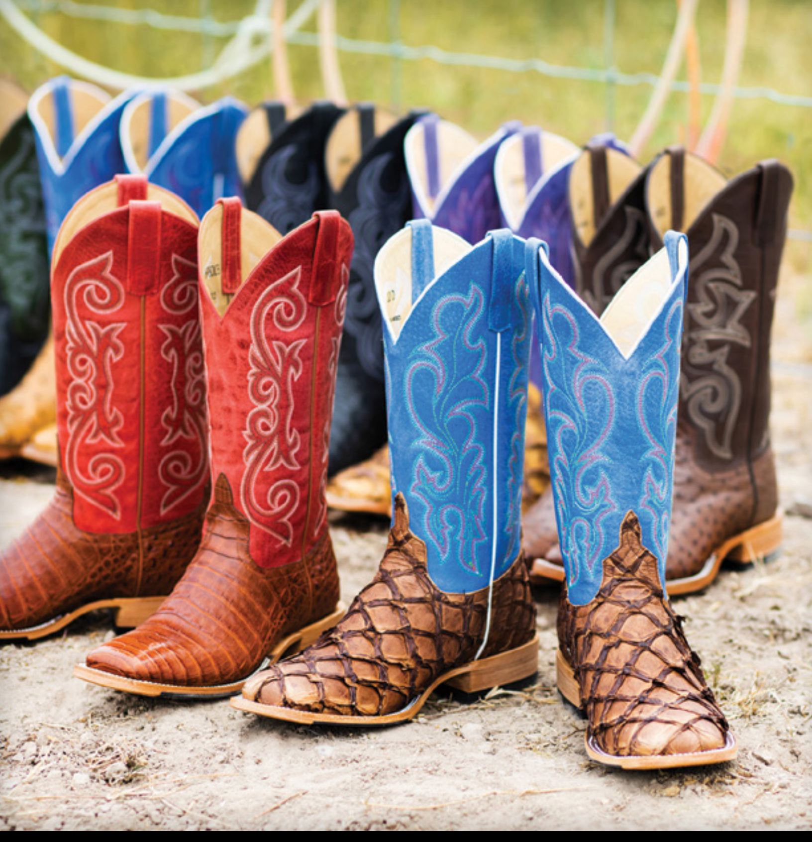
- PROUD TO PARTNER WITH THE SASSR RANCH RODEO -