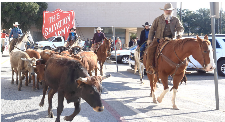
Cowboys on horseback drove a herd of cattle a mile around Ridgmar Mall at the "Cattle Drive for the Kettle Drive" to help kick off our red kettle drive in Fort Worth.