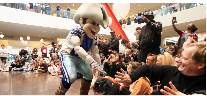
Famed Dallas Cowboys mascot Rowdy revved up the crowd at NorthPark Center in Dallas at our Angel Tree Extravaganza on Black Friday.