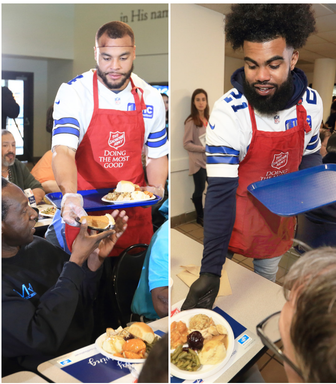
Cowboys QB Dak Prescott and running back Ezekiel Elliott served an early Thanksgiving meal to residents at our Carr P. Collins Social Service Center in Dallas.