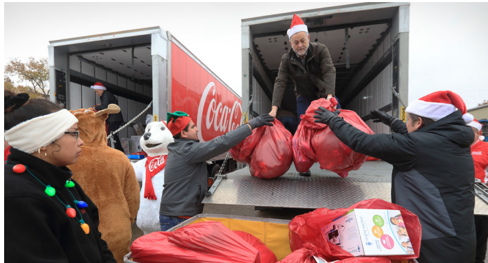
Coca-Cola employees unloaded two 18-wheelers of Angel Tree gifts at our Christmas Center in Dallas.