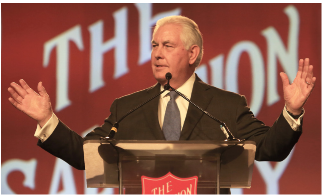
Former U.S. Secretary of State Rex Tillerson was keynote speaker at our 2018 Annual Doing the Most Good Luncheon.