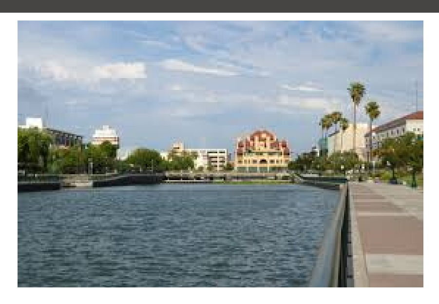
THE IDEAL CANDIDATE

The CEO of the 2nd District Agricultural Association must be an individual desiring to become an integral part of a valued community asset that provides benefit to many by offering an opportunity to gather at the fairgrounds and experience its many social, cultural, educational, entertainment and recreational activities. The ideal candidate must understand sound business practices and principles including marketing, public relations, personnel, financial administration, contract negotiation, and administration as well as new business development. It is desirable for the ideal candidate to have a general understanding of fairs, events and/or CA state laws/regulations. The ideal candidate must be a strategic thinker capable of fostering teamwork, collaboration and communication with many individuals such as staff, volunteers, Board members, elected officials, agency representatives, media, community stakeholders and the public. The workload and responsibilities of the CEO will require working irregular hours and weekends. The ideal candidate must demonstrate the ability to balance and manage the challenges of a multi-faceted work environment and adjust to shifting priorities. For the CEO to be successful they must be inclusive, exercise diplomacy, appreciate and understand diversity, inspire others to achieve the goals and objectives of the District and be creative as well as a problem solver knowing that many times there are limited resources available.