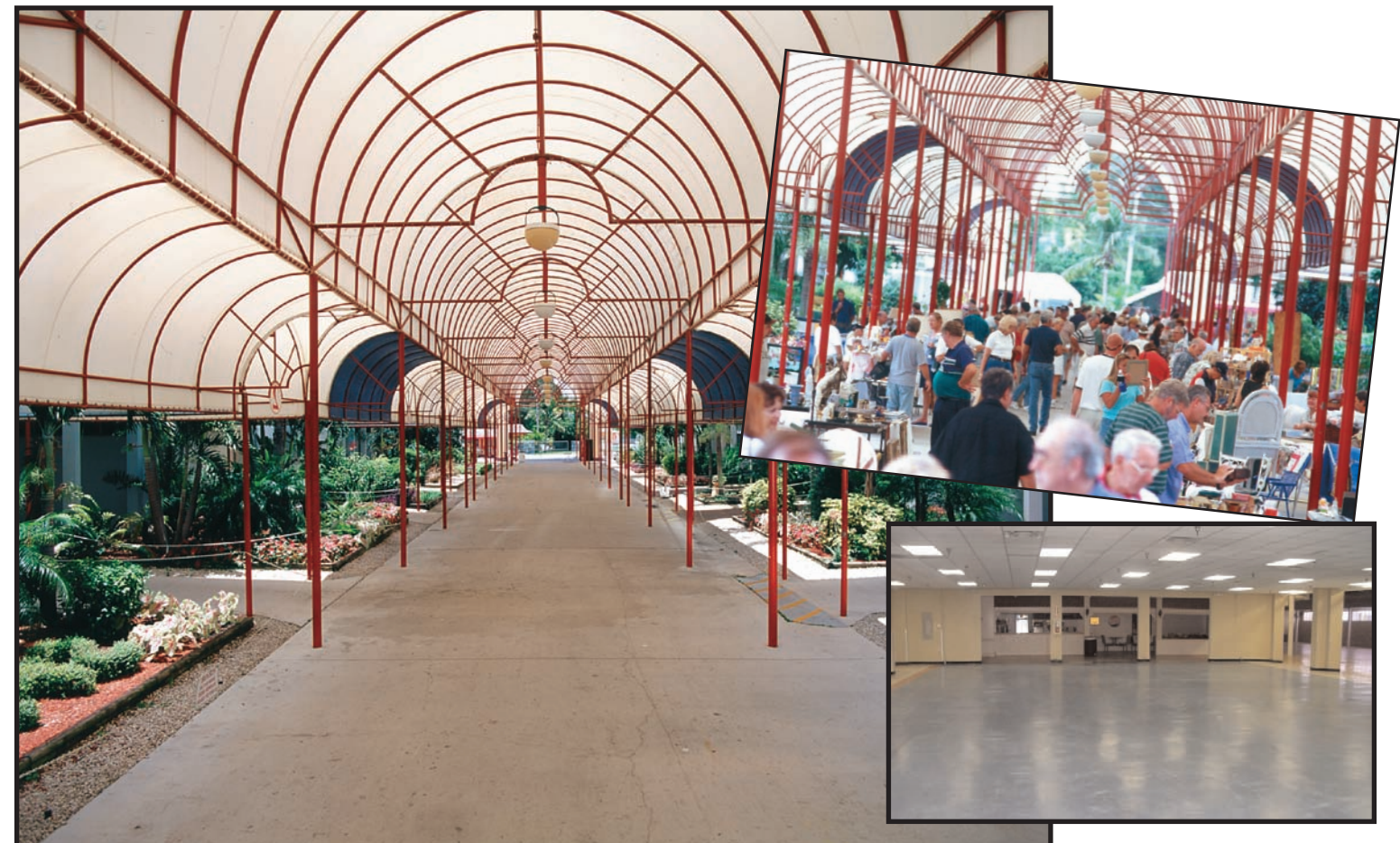
Concourse Connecting Buildings 1, 6-10 to Expo Building

9067 Southern Boulevard • West Palm Beach, FL 33411 (561) 790-4908 • Fax (561) 790-5206 Website: www.southfloridafair.com