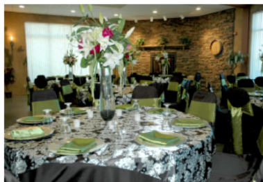
State Fair Room