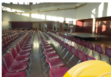
Modern Living Building