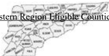
Eastern Region Eligible Counties

The highest amount of premium money will be awarded to each Junior Exhibitor with regards to their placing in the East Tennessee Junior Show or the Open Junior Show