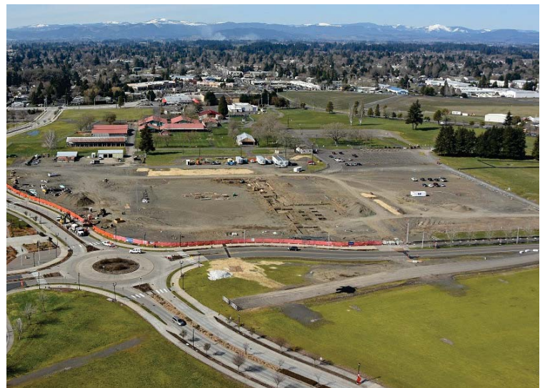
Site Work March 2019