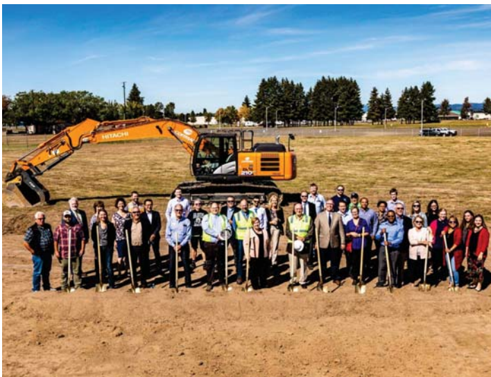
Groundbreaking September 2018