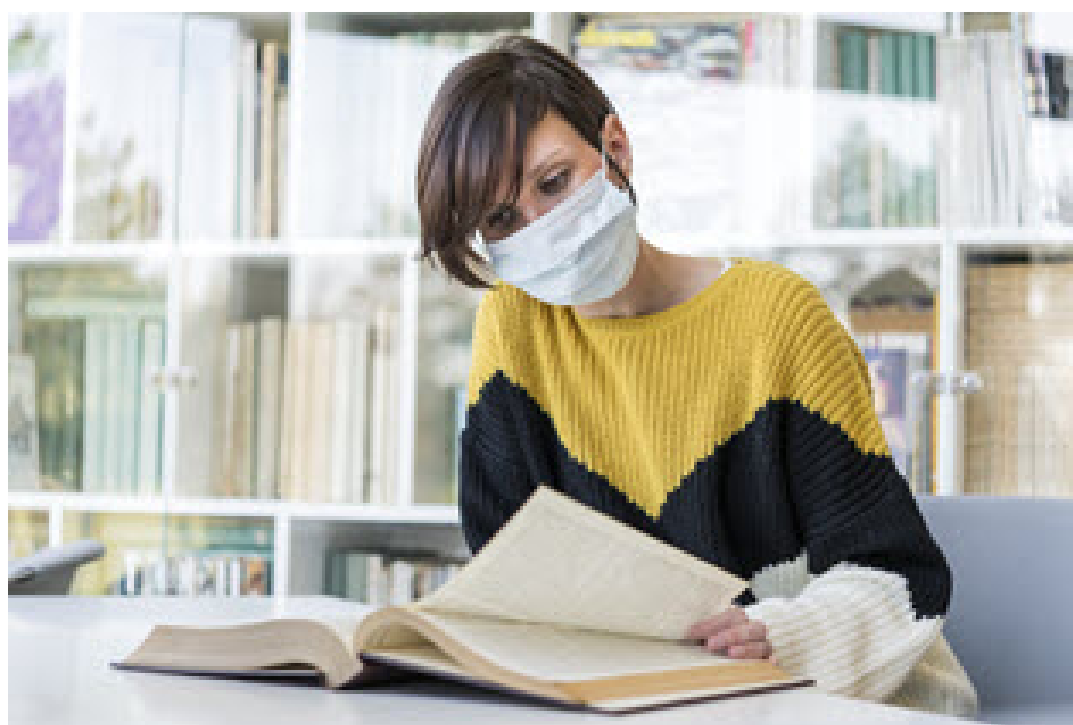
Choose digital materials or use curbside pick-up, when possible